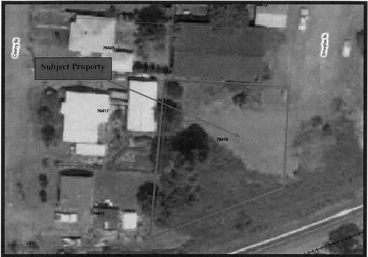
LANE COUNTY ASSESSOR'S MAP 21-35-16-14